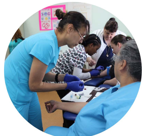
Mujeres Unidas Avansando in Home Health Aid and Plebotomy Job Trainings.