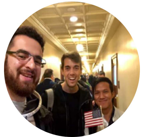
Burmese American Community Institute client celebrates becoming a U.S. Citizen.