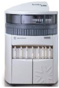
Ventana Discovery Ultra