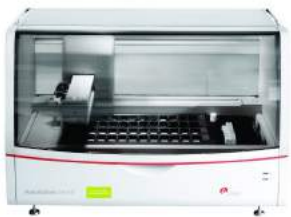
Dako Link Autostainer