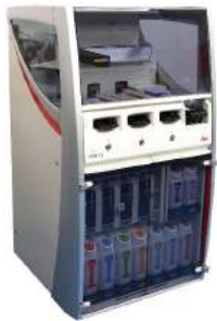
Leica Bond Rx