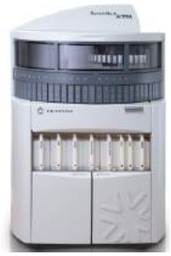
Ventana Benchmark Ultra